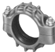
Style 77 Flexible Coupling