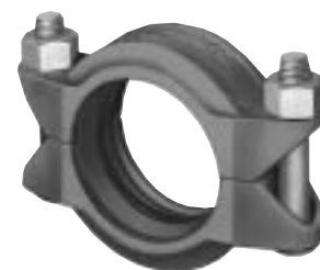
Style HP-70 Rigid Coupling