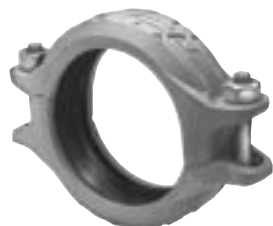
Style 07 Zero-Flex Rigid Coupling