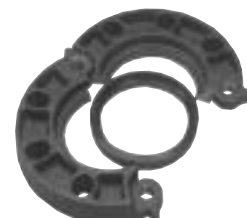
Style 741 Vic-Flange® Adapter