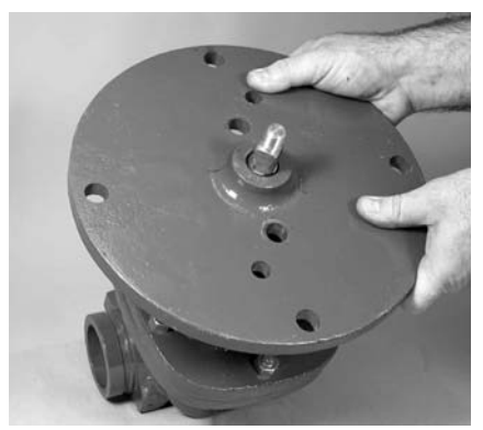
5. Install the mounting flange onto the valve.