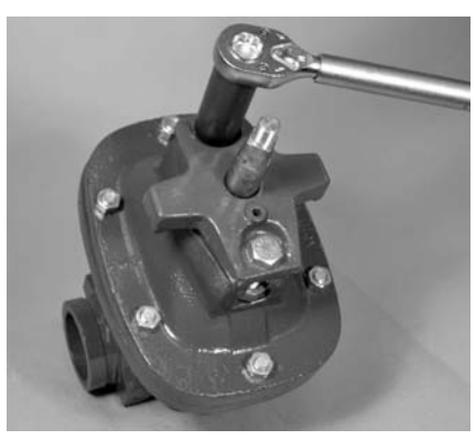
2 Loosen and remove the two stem seal flange mounting bolts from the valve.

If the valve is initially equipped with a handwheel, the handwheel must be replaced with a square operating nut in order for an upright indicator to be installed on the valve.