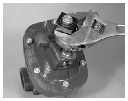
1. Fully open the valve by turning the square operating nut counterclockwise until you feel a sharp resistance.

This conversion can be done while the valve is installed in the piping system. Make sure the system is depressurized and drained completely.