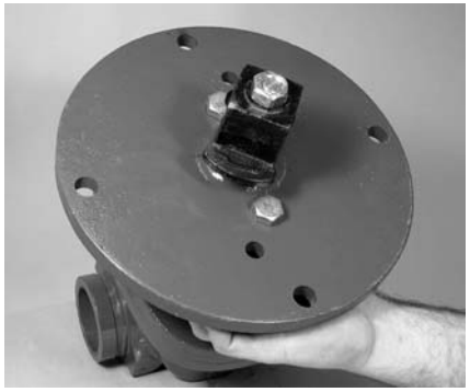
7. Reinstall the square operating nut onto the valve shaft. Reinstall and tighten the operator retaining nut onto the valve shaft to secure the square operating nut.

6. Reinstall and tighten the two mounting bolts.