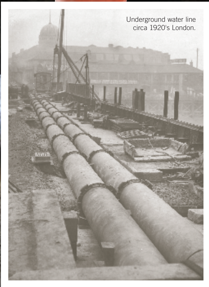
Underground water line circa 1920's London.