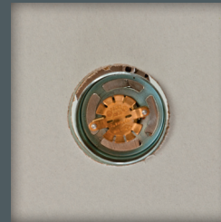
Adjustment screw is easily visible, even with a concealed sprinkler