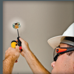
Loosen sprinkler/hose assembly in bracket with hand tool