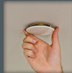
Install cover plate — done!*

* Does not imply complete installation instructions — consult the appropriate Victaulic installation and maintenance documentation.