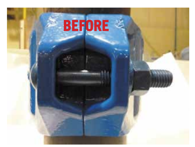
Figure 3a: Style 905 assembly before the 1000-hr C5-M salt spray testing