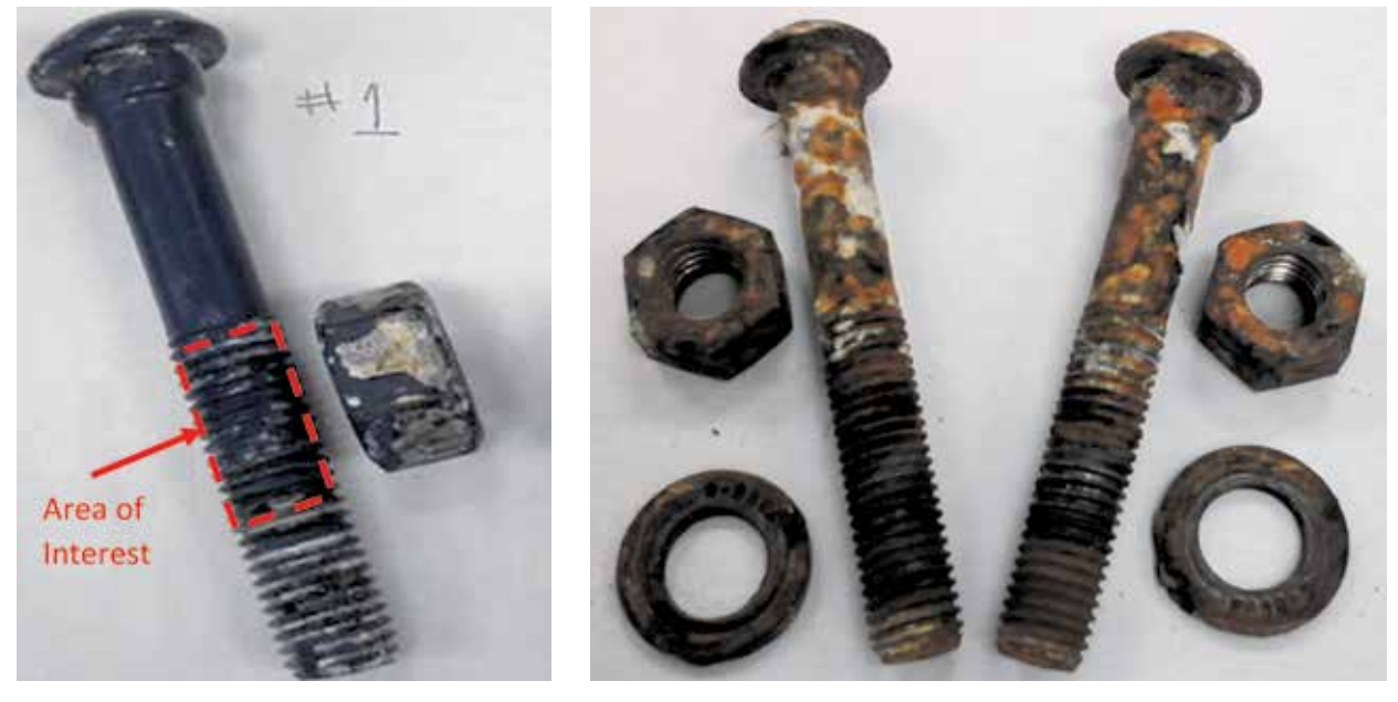
Figure 4: Victaulic fluoropolymer-coated hardware after 1000hr C5-M salt spray testing