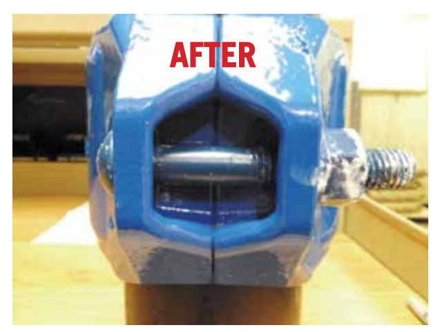
Figure 3b: Style 905 assembly after the 1000-hr C5-M salt spray testing