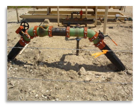
Fig. 4: Victaulic Material Capabilities