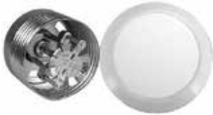
Sprinkler and Cover

Standard Pendant ½" NPT (15 mm BSPT) Thread ½" (13 mm) Orifice Refer to publication 41.03.